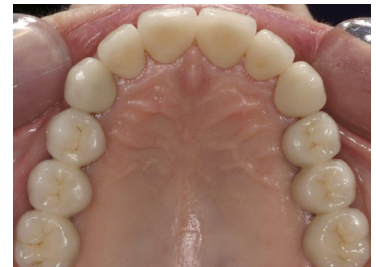
Build back your bite