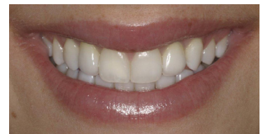
Build back your smile